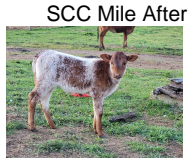
SCC Mile After