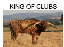
KING OF CLUBS