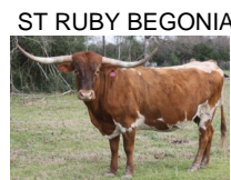
ST RUBY BEGONIA